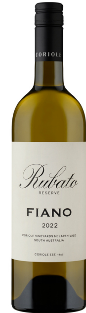
RUBATO RESERVE FIANO

The Vita Reserve is a selection of the best performing Sangiovese vineyard, interestingly different vintages favour different vineyards. The Vita Reserve is a small bottling that is only produced in exceptional vintages.