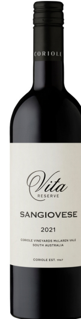
VITA RESERVE SANGIOVESE

The resulting wine is a savoury and elegant expression, a long and full flavoured cabernet which will cellar well for up to 20 years.