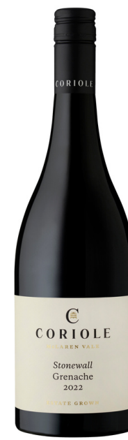
STONEWALL SINGLE VINEYARD GRENACHE

Our Koukalaka Single Vineyard Sangiovese explores a more ethereal expression of sangiovese — it's floral, fragrant and vibrant, with a finer tannin profile. The medium weight and vibrancy of flavour is a counterpoint to our other single vineyard sangiovese — the rich, robust and earthy Vita Sangiovese.