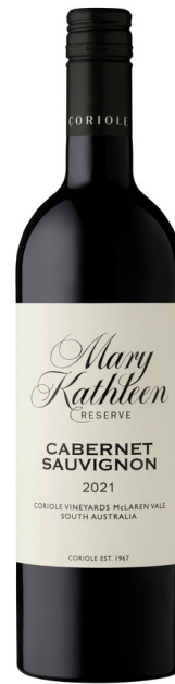
MARY KATHLEEN CABERNET SAUVIGNON

The Willunga 1920 Shiraz is a very different wine to those produced from the Coriole estate. The nose shows blueberry and sage with hints of charcuterie and lavender. The palate is very soft and rich, with flavours of blackberry and black olive, beautifully framed by very fine tannin and finished by a floral rose lift.