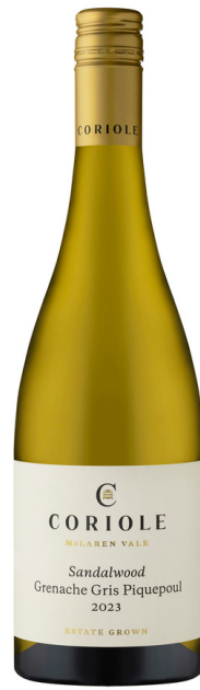
SANDALWOOD GRENACHE GRIS / PIQUEPOUL

"The Optimist" is a dry and savoury style that shows the great capacity of the variety to age. The wine is produced from a single vineyard planted at Coriole in 1977.