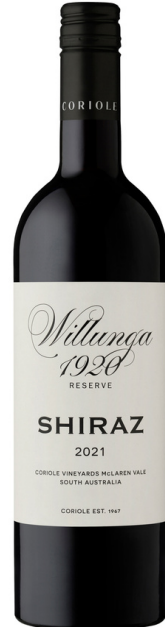
WILLUNGA 1920 RESERVE SHIRAZ

The soil and roots are extremely deep and generally no irrigation is required. The wine is matured in French oak for approximately 18 months and then receives 18+ months in bottle before release.