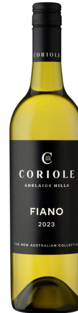
FIANO ADELAIDE HILLS

This variety loves McLaren Vale's warm, Mediterranean climate which encourages wines of aromatic intensity and textural generosity.