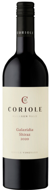
GALAXIDIA SINGLE VINEYARD SHIRAZ

The Galaxidia vineyard was planted in 1998, featuring a north facing slope and produces wines of fragrance and intensity. This small bottling of a 100 dozen is from the best block on this vineyard.