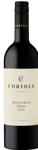
RIESLING BLOCK SINGLE VINEYARD SHIRAZ

The name "Pettigala" comes from the Pettigala area in Sri Lanka, home to tea production and spice farming. When this wine showed its characters of black tea, cardamom, clove and cinnamon, we had to name it as our own "spice mountain". The Pettigala Shiraz has beautiful fragrance and length of flavour.