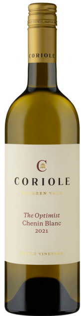
THE OPTIMIST SINGLE VINEYARD CHENIN BLANC

Coriole Vineyards have produced Chenin Blanc in McLaren Vale since the late 1970s. Traditionally released as a fresh young style; Coriole Chenin Blanc has developed a loyal following with white wine drinkers across Australia.