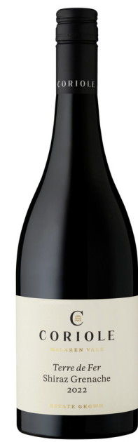
TERRE DE FER SHIRAZ / GRENACHE

The Stonewall vineyard is bush vine, and receives a lot of viticultural attention to ensure even ripeness. Bunch management leaves us with lower crop levels, and we make sure to pick the fruit at the right time to give us moderate alcohol, creating this beautiful, very fragrant, ethereal style of grenache.