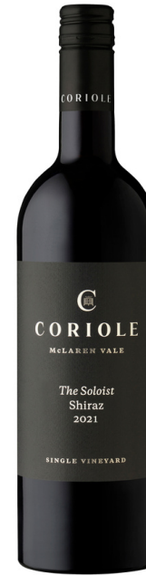
THE SOLOIST SINGLE VINEYARD SHIRAZ

The resulting wine is always rich and powerful, and in 2018 it was one of our top performing blocks albeit with minuscule yields. Full, intense and richly flavoured shiraz.