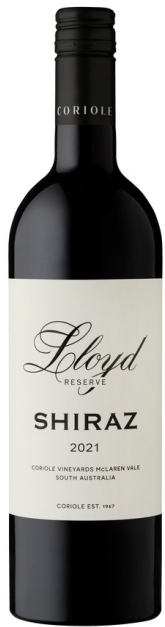
LLOYD RESERVE SHIRAZ

Shiraz is a great tradition in McLaren Vale, dating back to the 1850s. Lloyd Reserve Shiraz is produced from a single vineyard at Coriole that was planted either late 19th century or early 20th century – some records indicate as early as 1875. The first Lloyd Reserve wine was released in 1989.